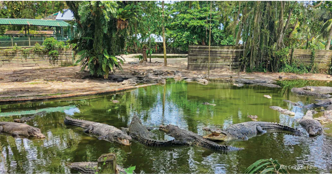
Miri Crocodile Farm