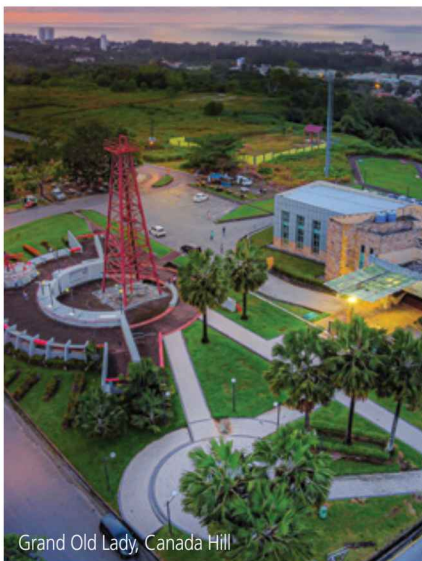
Grand Old Lady, Canada Hill